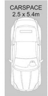
CARSPACE 2.5 x 5.4m BASEMENT 2