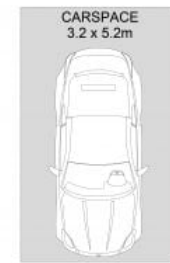
CARSPACE 3.2 x 5.2m GROUND LEVEL

Disclaimer- Floor Plan measurements are approximate and are for illustrative purposes only. While we cannot doubt the floor plans accuracy, we make no guarantee, warranty or representation as to the accuracy and completeness of the floor plan.